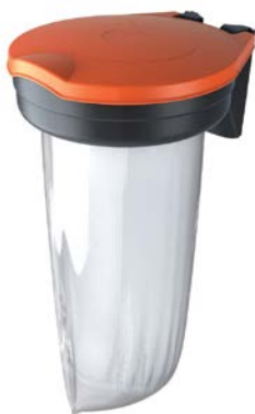
Skipper recycle bin PRODUCT CODE: BIN01