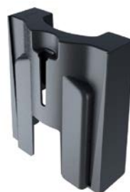
Suction pad support bracket PRODUCT CODE: P/SUPPORT01