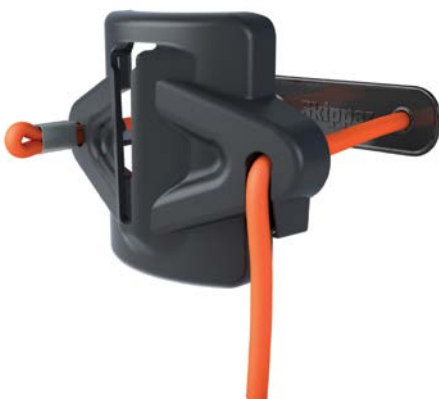
Skipper cord strap clip (magnetic)