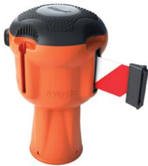
The Skipper unit PRODUCT CODE: SKIPPER01