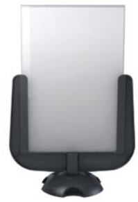
Skipper A4 sign holder PRODUCT CODE: SIGN01