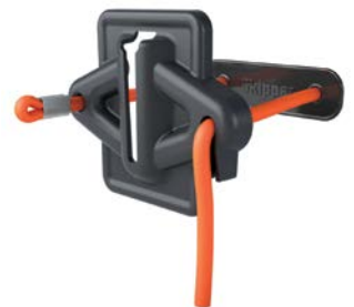
Magnetic cord strap holder/receiver PRODUCT CODE: CORD01