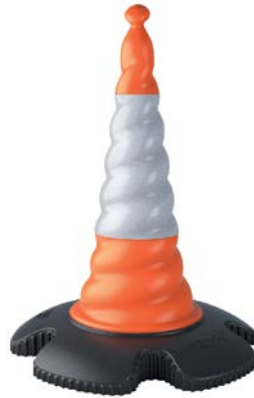
Skipper road cone PRODUCT CODE: CONE01