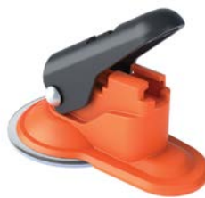
Suction pad holder/receiver PRODUCT CODE: PAD01