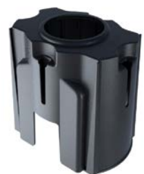
Post & base collar PRODUCT CODE: POST04