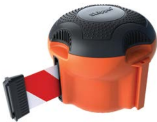
The Skipper XS unit PRODUCT CODE: XS01