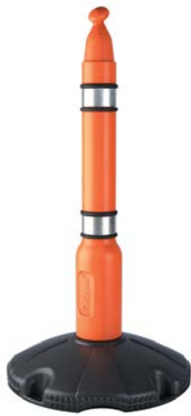
Post & base system PRODUCT CODE: POST01 (POST), POST02 (BASE)