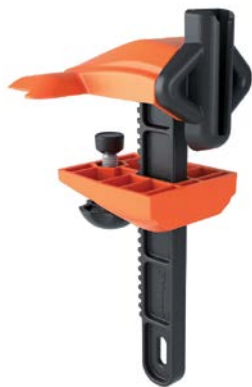
Clamp holder/receiver PRODUCT CODE: CLAMP01