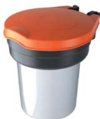
Skipper safety dispenser PRODUCT CODE: DISP01