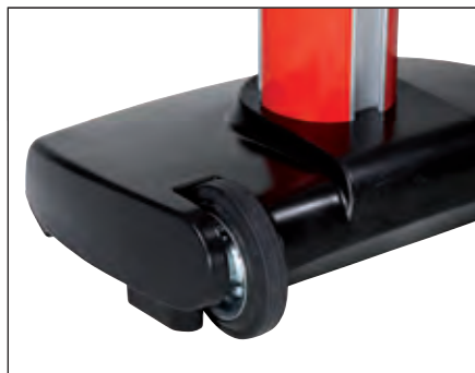
Self-contained, easy moving wheels